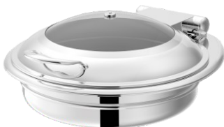
W36104 Round 36cm 6.8L food pan