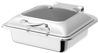
W35104 Square 2/3 size 5.5L food pan